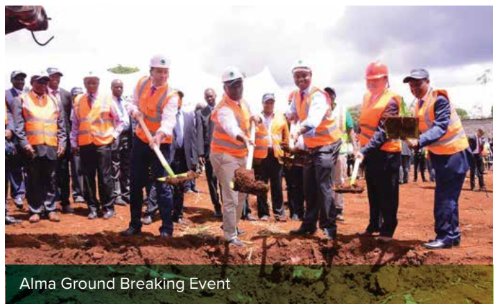
Alma Ground Breaking Event