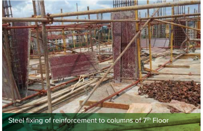
Steel fixing of reinforcement to columns of 7 th Floor

Construction work on the other blocks is set to begin as per the below schedule: