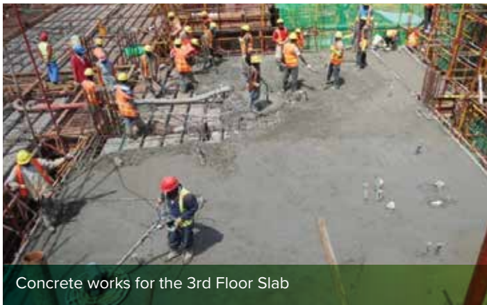
Concrete works for the 3rd Floor Slab

2. Block B: The casting of the 3rd floor slab has been done and the formwork for the 4th floor slab is ongoing.