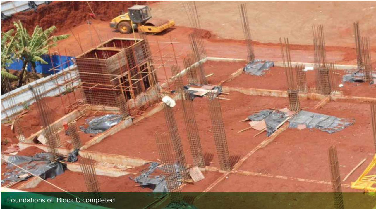
Foundations of Block C completed

3. Block C: Foundations of Block C have been completed and we shall now be moving to the ground floor level.