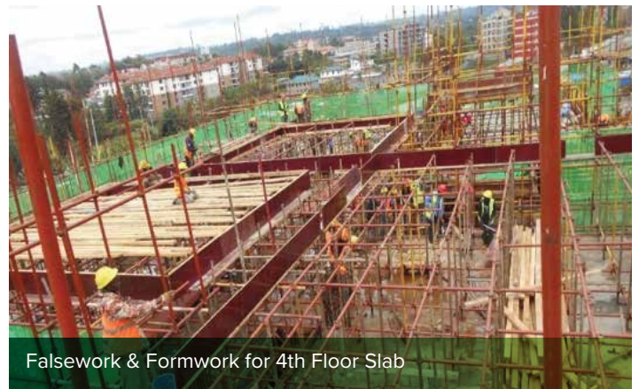
Falsework & Formwork for 4th Floor Slab