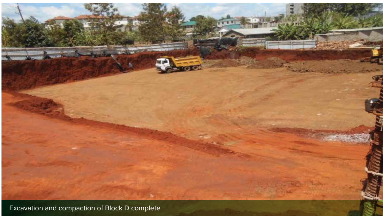
Excavation and compaction of Block D complete

4. Block D: We have completed the excavation of Block D and further done compaction in readiness for laying the foundation.