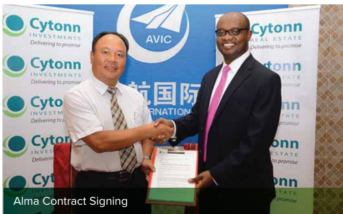
Alma Contract Signing

We went through a rigorous tender process in March 2016 and out of 18 possible contractors, we selected CATIC to undertake construction of the Alma. The ground-breaking event followed on 11th April 2016 and since then, we have kicked off construction and have made considerable progress on site.