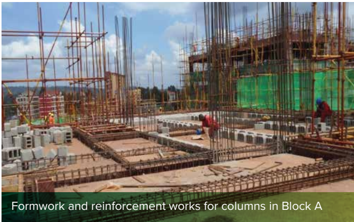
Formwork and reinforcement works for columns in Block A

1. Block A: The 4th floor slab has been cast and we are working on the formwork for the 5th floor. We are planning to have a show house situated on the 1st floor level of Block A. Our target is to have the show house completed by March 2017.