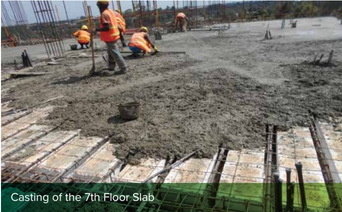
Casting of the 7th Floor Slab

5. Block G: This is our most advanced block and the casting of the 7th floor has been completed. We expect to complete the superstructure of the building in the next 3 months.