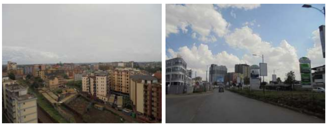
-View of the neighborhood-