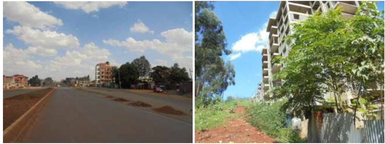
-View of the site entrance & access road-