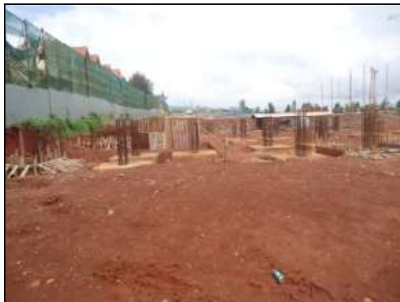
-Views of the subject property -