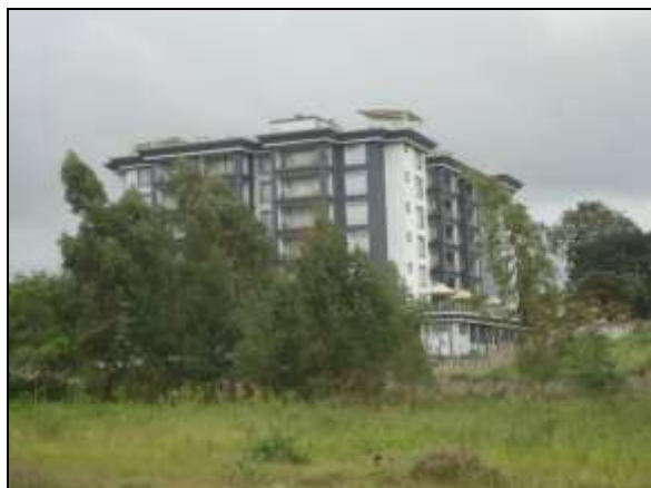
-View of the neighboring Fourways Junction Estate-