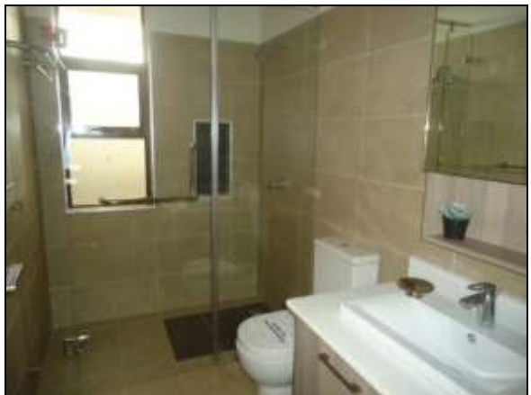
-Select views of the show houses-