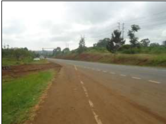
-View of the access road & neighborhood-